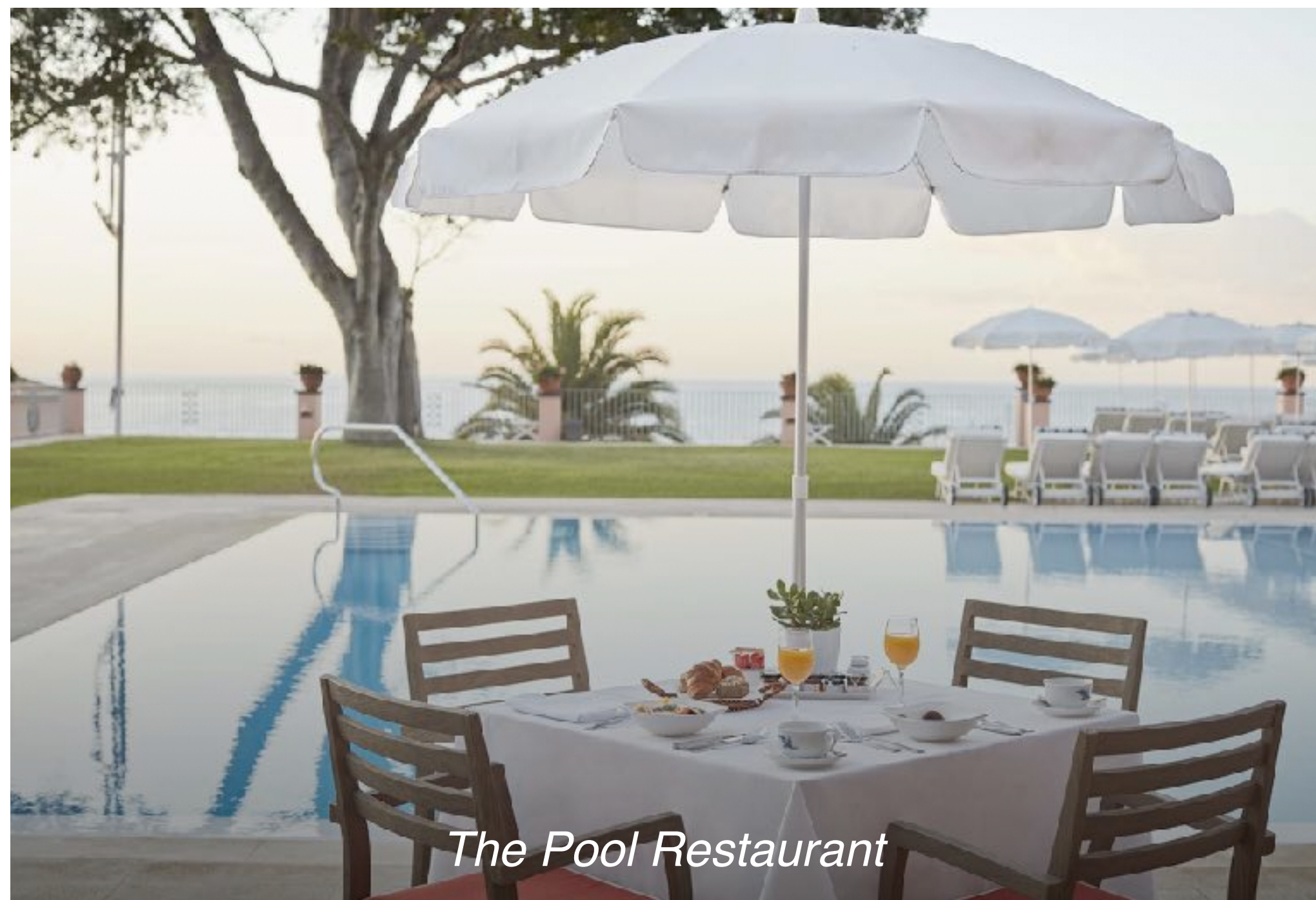
The Pool Restaurant