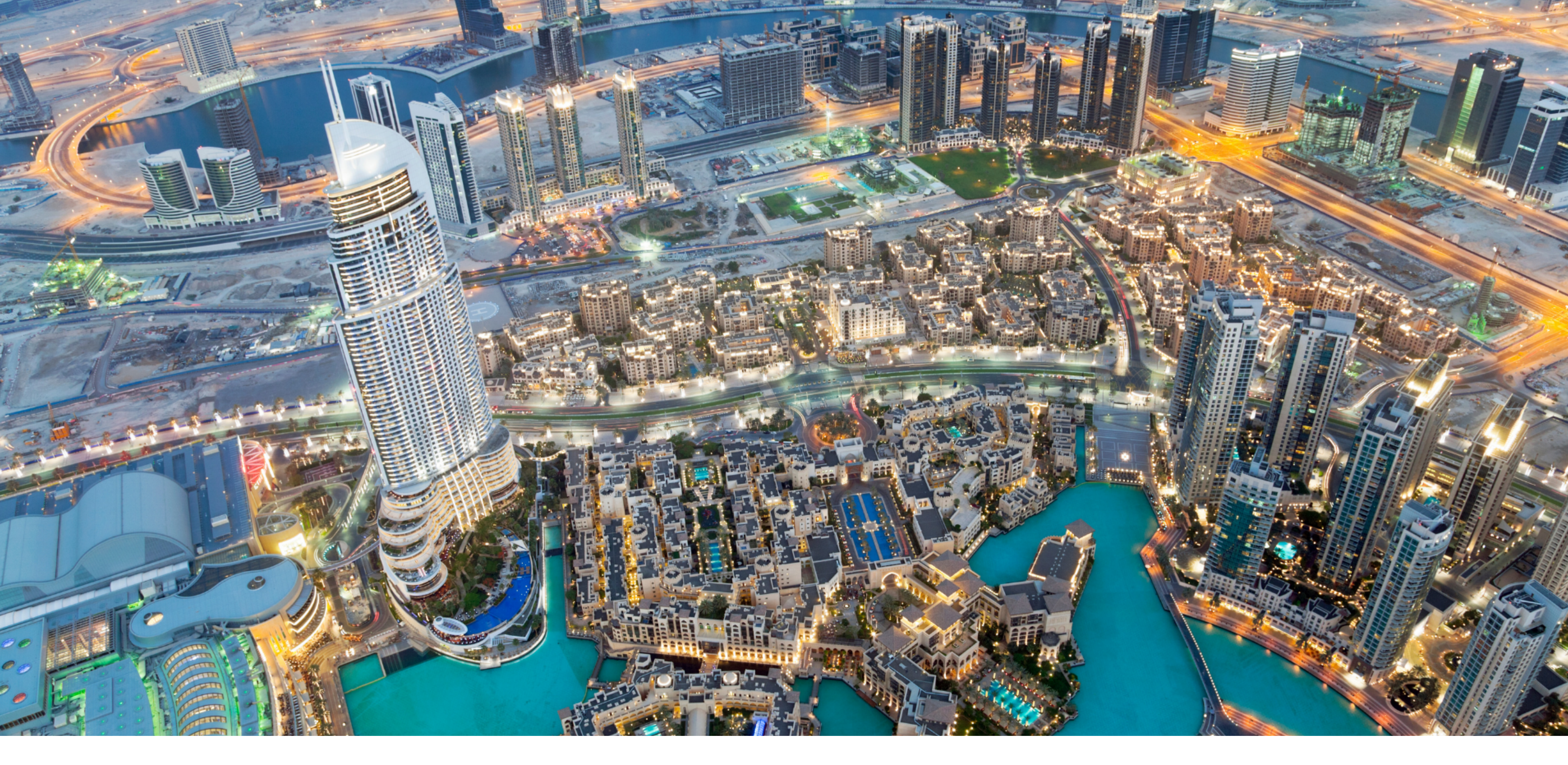
Additional tips for living unique and exclusive experiences